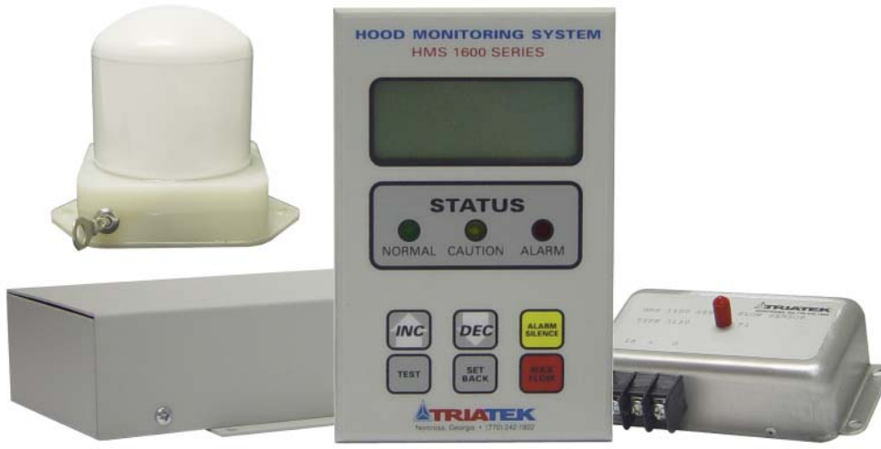
Standard 4x16 LCD Display Shown